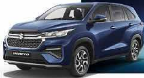
NEXA BLUE (CELESTIAL)